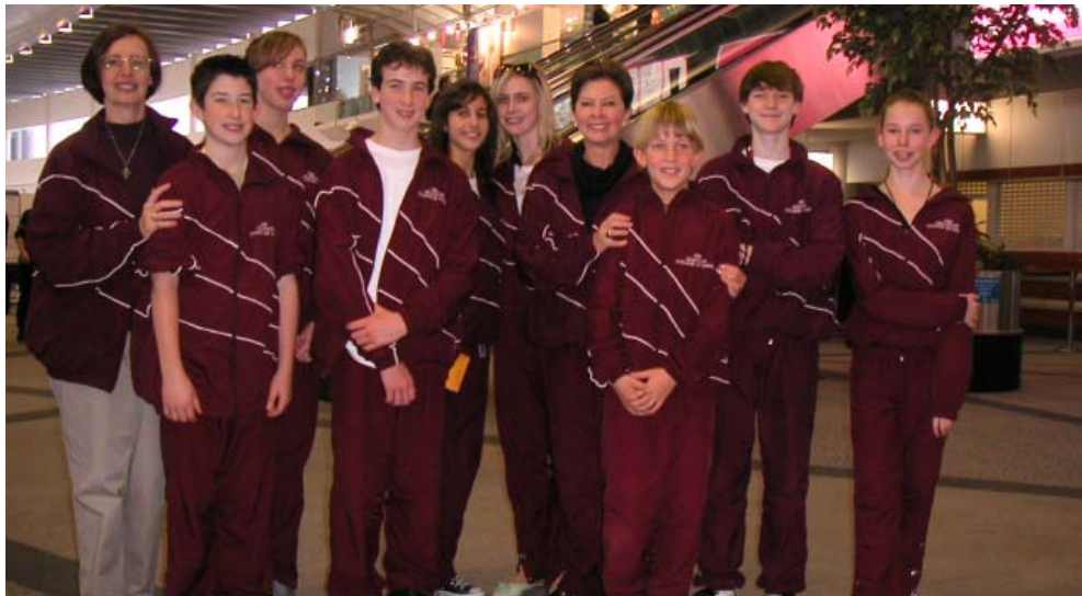
Students prepare to depart for London and The Royal Ballet School's International Summer School programme.

In 2004 she successfully auditioned as a performer but his time there was no need for the rigorous audition process, as she was invited back as a guest choreographer and performer.