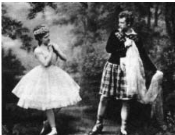
ANNA TYSCHEN AND HANS BECK IN LA SYLPHIDE (ROYAL DANISH BALLET, COPENHAGEN, 1882)