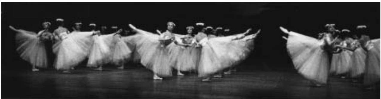
THE CORPS DE BALLET IN ACT II OF LA SYLPHIDE (PACT BALLET, SOUTH AFRICA, 1989)

The wedding guests arrive and in the ensuing celebrations James forgets about his vision. During the great wedding reel, however, he sees her again and just as he is about to give the wedding ring to Effie, the Sylphide snatches it away and puts it on her own finger. Unable to resist, James follows her out into the forest. Family and friends rush off to find him. Effie recalls Madge's prophesy and collapses in tears.