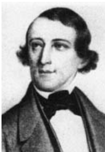
AUGUST BOURNONVILLE (1805 - 1879)

This ballet has been performed over 750 times by the Royal Danish Ballet, having been in their repertory continuously for 168 years. La Sylphide was one of the first ballets to successfully express Romantic philosophy, inspiring many changes in theme, style, technique and costumes.