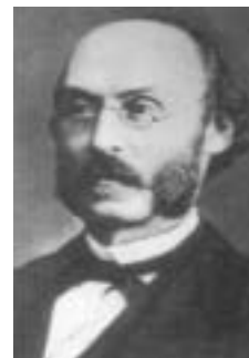
LUDWIG MINKUS (1826 - 1917)

LUDWIG MINKUS was one of the most important composers in 19th century Russian ballet. He wrote scores for numerous Petipa ballets including Don Quixote and La Bayadère and also wrote additional music for Paquita . Although an Austrian by birth, he worked most of his career in Russia. He favoured the Viennese café-style waltz and often used it very effectively, though quite inappropriately. Minkus composed La Bayadère's score to fit Petipa's choreography and successfully juxtaposes waltzes for Indian temple dancers with sweeping lyricism for the Kingdom of the Shades.