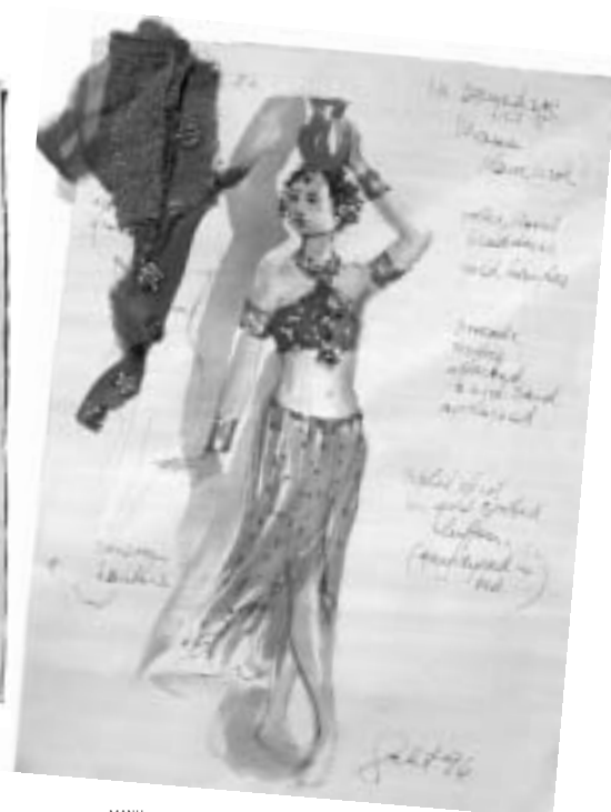
MANU COSTUME DESIGNED BY PETER CAZALET 1996