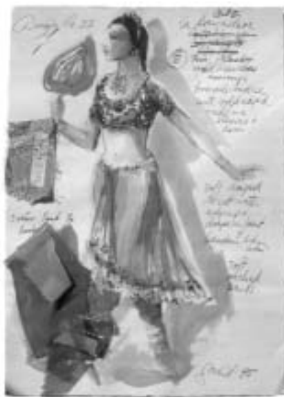
FAN LADY COSTUME DESIGNED BY PETER CAZALET 1995