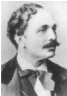
MARIUS PETIPA (1818 - 1910)

MARIUS PETIPA began his legendary career as a choreographer after he moved to St Petersburg in 1847. Arguably the most influential choreographer of 19th century classical ballet, he created Swan Lake , The Sleeping Beauty , Don Quixote and La Bayadère amongst others. He choreographed some 50 ballets for the Imperial Theatres in Russia and also re-staged Paquita , Coppelia , Giselle and Le Corsaire from the French repertoire; his versions of these classics continue to form the basis of international productions that we know today.