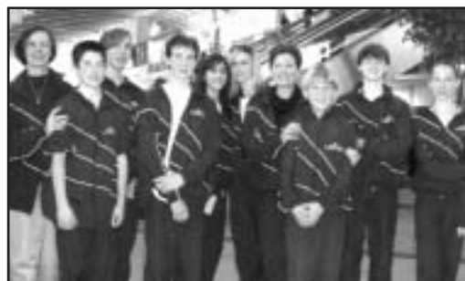
SUMMER SCHOOL TOUR GROUP AT PERTH AIRPORT 25 JULY 2005