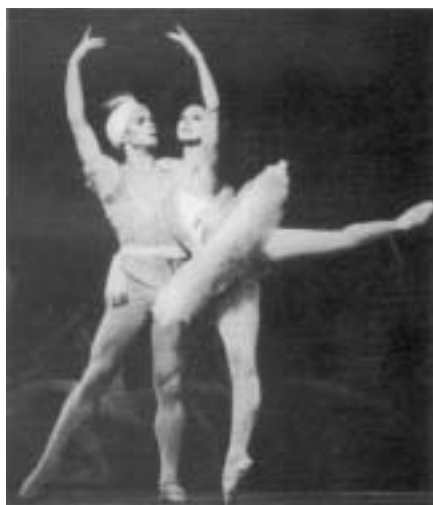
RUDOLF NUREYEV AND MARGOT FONTEYN IN THE KINGDOM OF THE SHADES (THE ROYAL BALLET, LONDON, 1963)

S OLOR smokes opium to deaden the pain and remorse he feels after Nikiya's death. He hallucinates, dreaming that he has visited the Kingdom of the Shades, where he sees an infinite procession of Nikiyas before him. In the Kingdom of the Shades, Solor is once again united with Nikiya.